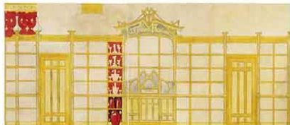
Lucy McKenzie Interior (Detail: P. Hankar - Wijnand Fockink, Rue Royale, Brussels, 1897), 2007