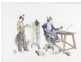
Lucy McKenzie Untitled, 2011