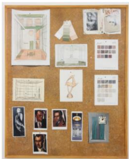
Lucy McKenzie Quodlibet XXI (Objectivism), 2012