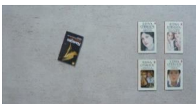
Lucy McKenzie Quodlibet XXXIX, 2014

Photo courtesy of the artist; Galerie Buchholz, Cologne/Berlin/New York; and Cabinet, London.