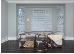
Lucy McKenzie Quodlibet LX (Violet Breche Desk), 2015

Tisch: 190 x 240 x 160 cm; Stühle: 97 x 50 x 50 cm each