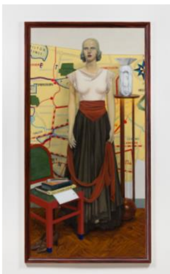
Lucy McKenzie Rebecca, 2019

All images may be used free of charge for editorial reporting on this exhibition (according to § 50 UrhG) at the earliest 3 months before the beginning of the exhibition and up to 6 weeks after the end of the exhibition, on condition that the photographer and the copyright holder are credited as the source. The images may not be bled, cropped, guttered or overprinted. Use for social media purposes is not permitted without permission.