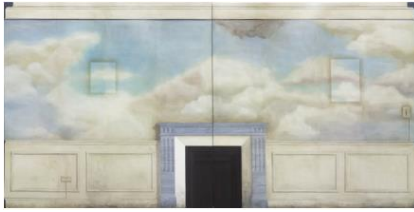
Lucy McKenzie May of Teck, 2010