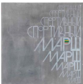
Lucy McKenzie Sport March, 2000